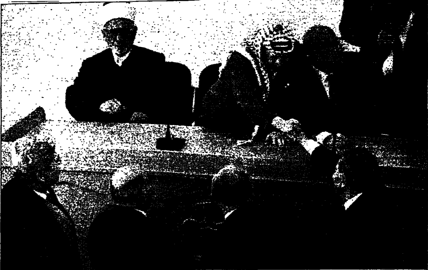
Yasser Arafat accepts congratulations after swearing himself in as president of the Palestinian National Authority yesterday.